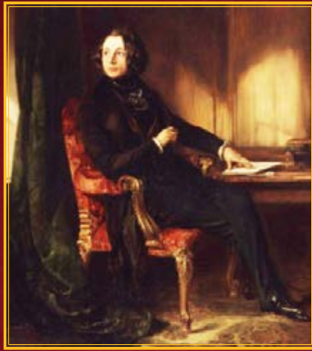
Charles Dickens in 1839

The fairies came to his christening. One said, "My gift is early hardship; as a child, he shall know the ugliness of life." The second said, "My gift is his abandonment; he shall be a castaway." The third, "His school shall be the streets." The fourth, "I will give him a sensitive spirit, so that he may feel early pain sharply, and remember it vividly all his life." The last fairy said, "I will give him genius. Out of the hardship shall come the power to live a hundred lives. The castaway shall have the freedom of the whole world of men and women. The education of the streets shall provide him with boundless treasures of comic and tragic invention. The humiliations of the child shall fertilise the imagination of the poet."